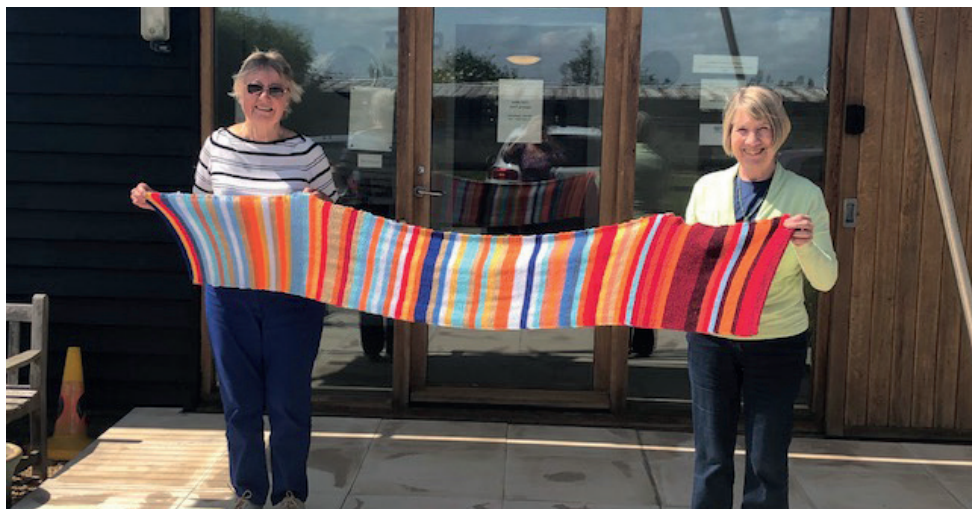
All photographs show 1919 on the far left and 2018 on the right, as you are viewing the images.